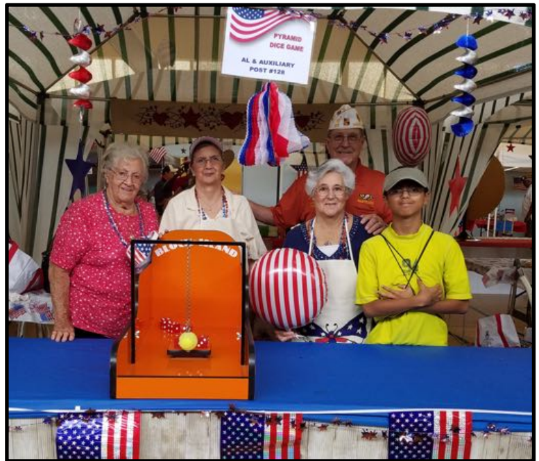
Perry Point Veterans Carnival

Starts at 8 pm until 12 am in the Post Lounge Come out and join the Fun! Sing along with the oldies!