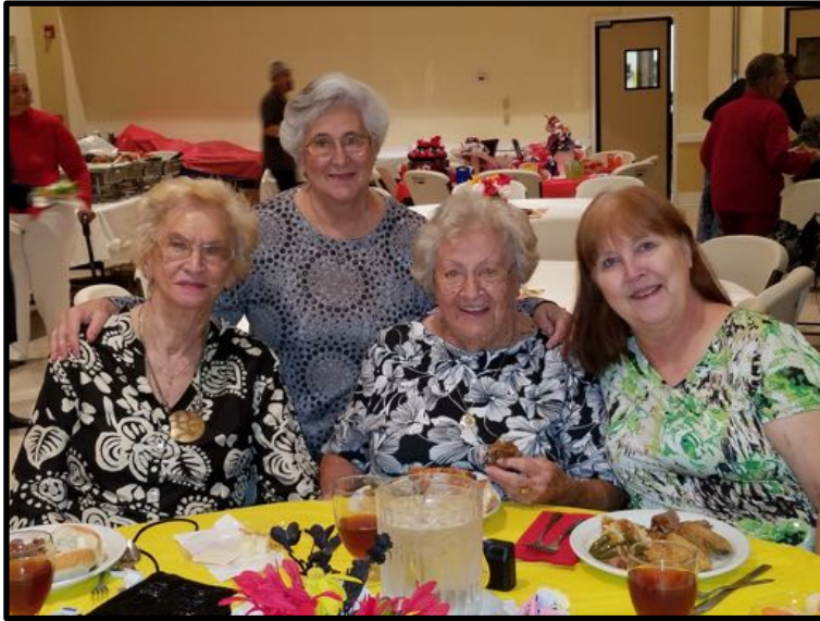
Ladies enjoying the Banquet at the Auxiliary Fall Conference in Fredrick, MD.