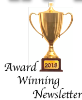
Award 2018 Winning Newsletter