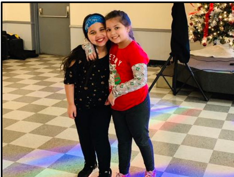
Some of our Christmas Party Family