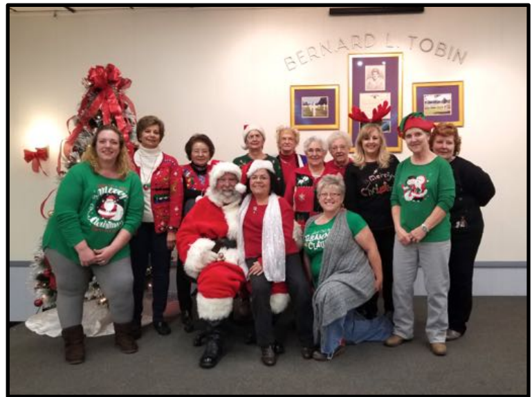
Santa and his helpers at our annual Children's Christmas Party