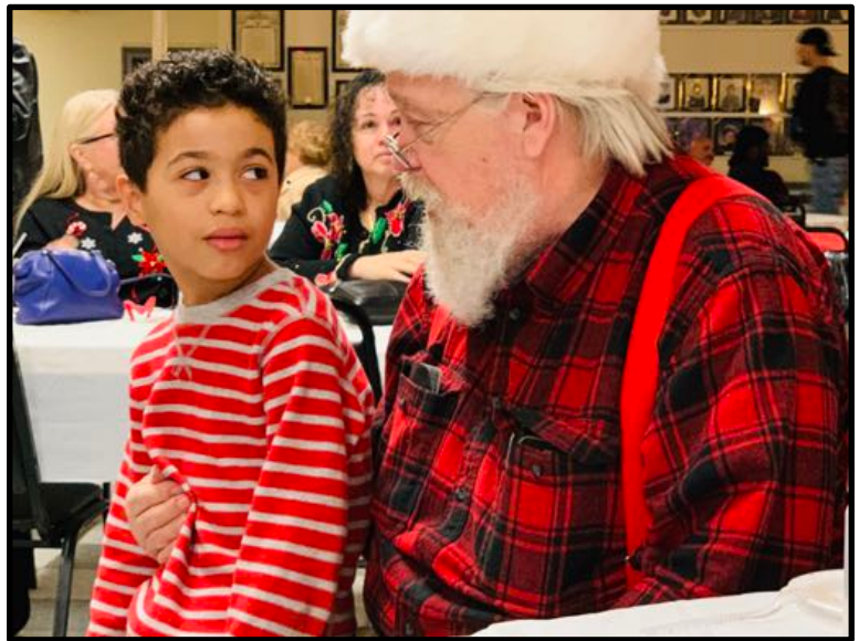
"Are you really Santa Claus?"