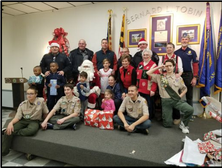
Annual "Shop With A Cop" Santa and his Helpers