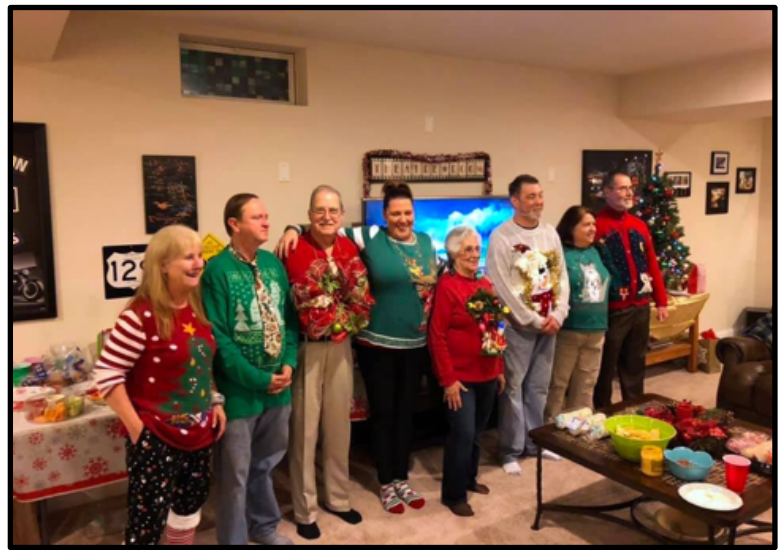
The Ugliest Sweater Contest at the 2 nd Annual Commander's Staff Christmas Party and Ugly Sweater Contest.