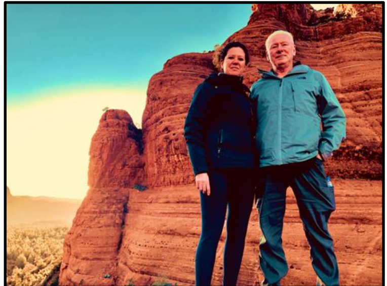
Sedona Red Rock Canyon, Arizona

Another photo taken in Antelope Canyon . This shot is called the “Candlestick and Flame”. It was also taken with a standard iPhone camera. The shapes and colors are all real – there was no editing done.