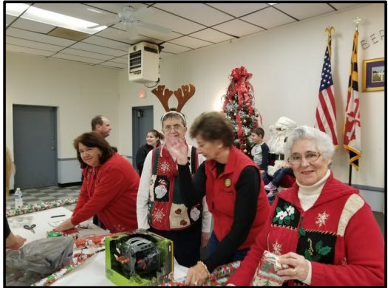
Unit 128 Wrapping the Shop With A Cop Gifts