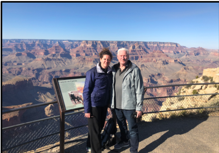
The Grand Canyon

This photo was taken in Antelope Canyon where around every corner is another of God's "Works of Art". Antelope Canyon is located in Page, Arizona, just a few miles northeast of the Grand Canyon. This photo is a part of the canyon that is shaped like a heart and was taken with a regular iPhone camera. The shapes and colors are all real – no editing needed.