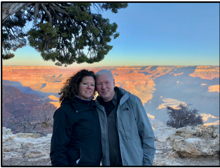
The Grand Canyon at Sunrise