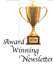
Award Winning Newsletter