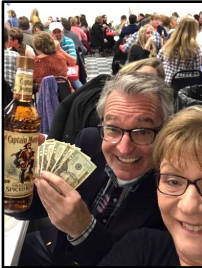
One "lucky" winner!

Unfortunately, we had to limit the ticket sales to 220 tickets due to space limitations. Our Bull Roast was a complete sell-out! We could have sold many more tickets as there were a lot of requests for tickets that we were not able to accommodate. So, be sure to get your tickets early next year to be certain of getting a table.