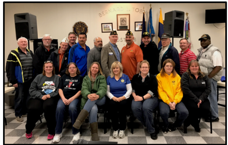
The 1 st Extension Institute Graduate Class