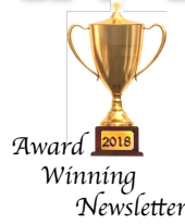
Award Winning Newsletter