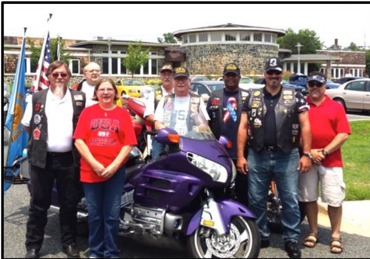
Post 128 ALR waiting to ride in the July 4 th Parade

American Legion National Headquarters is increasing membership dues by $5 which will take effect January 2016. Be sure to pay your dues before December 31, 2015 to avoid this increase. There is a $100 discount for PUFL membership, if paid as a single payment.